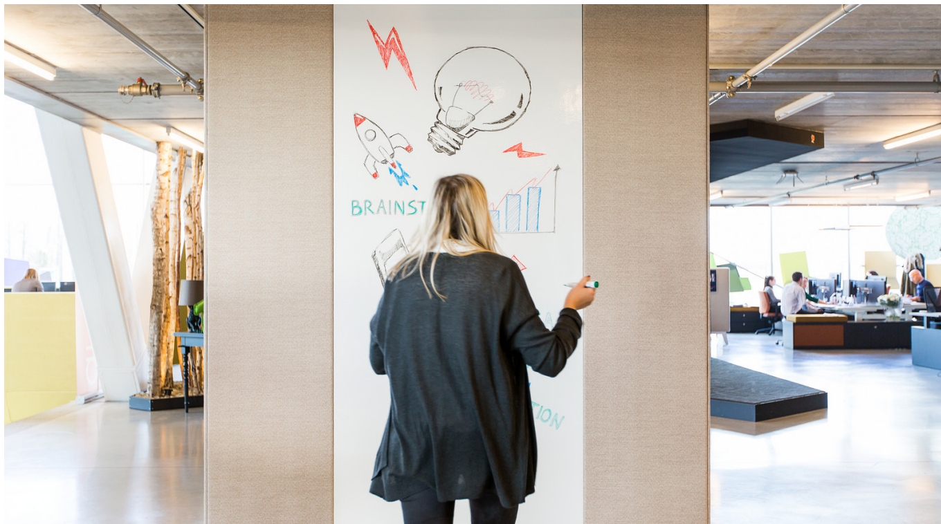
Work pleasure by Drisag